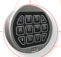
optional electronic lock