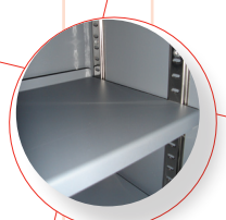
fully adjustable shelving system