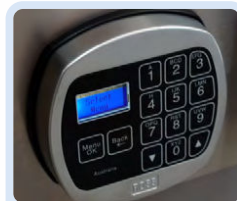
Digital Ross 100 L02 & L22