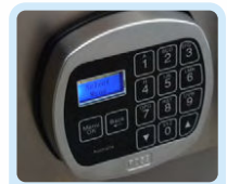
Digital Upgrade (CL2)