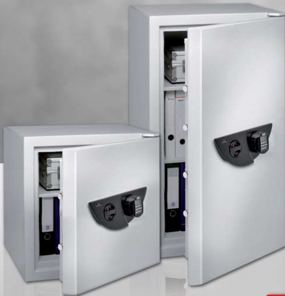
OfficeDoku 121 E & 124 E

OfficeDoku Safes are type tested and supervised security by ECB.S.v. With three-sided locking through 28mm Ø bolts, 1 hour fire protection for paper documents, intelligent menu-driven operation, up to 10 users and the option for biometric security, OfficeDoku Safes cater to all your commercial security needs.